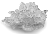
AF 124 Flake ice Residual water content 25%