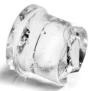
MXG L 938 Large Gourmet 39 g Ø 38 x H 41 mm