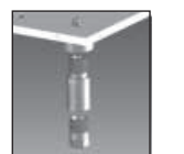
Available as optional KITLEGSEXT000