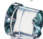
Ø 29 x H 34 mm