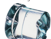
Ø 38 x H 41 mm

This product qualifies for the following listings: