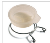
Patented anti-Scale system