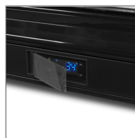
Protective thermostat cover