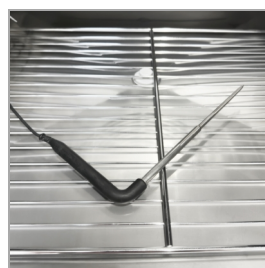
Core sensor included