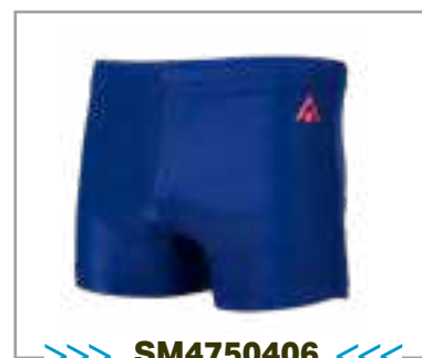
>>> SM4750406 <<< NAVY BLUE RED 65/70/75/80/85/90/95