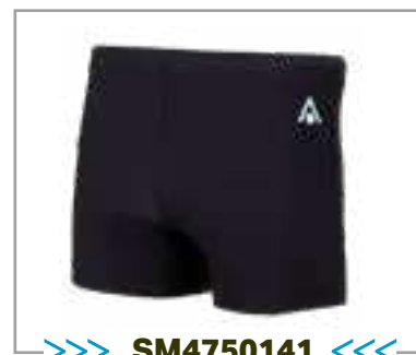
>>> SM4750141 <<< BLACK LIGHT BLUE 65/70/75/80/85/90/95