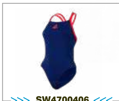
>>> SW4700406 <<<< NAVY BLUE RED