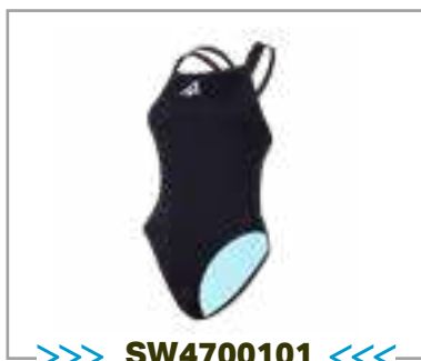
>>> SW4700101 <<<< BLACK BLACK