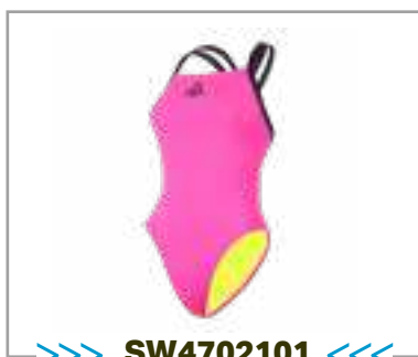
>>> SW4702101 <<<< BRIGHT PINK BLACK