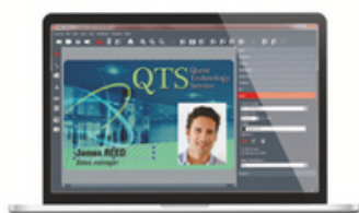
Evolis Badge Studio®+ card personalization software (including import from databases)