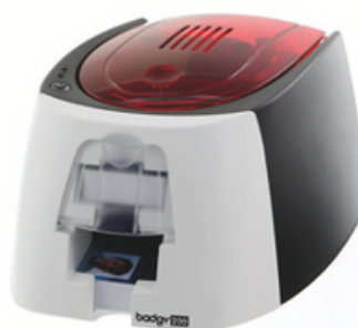
Badgy200 card printer