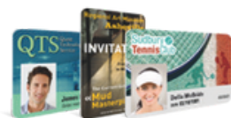
Online card template library