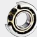
Bronze ball guided cage