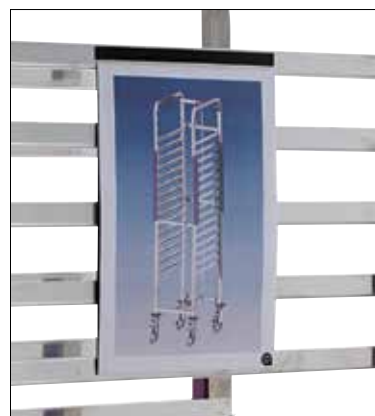
Magnetic pocket - A4 size