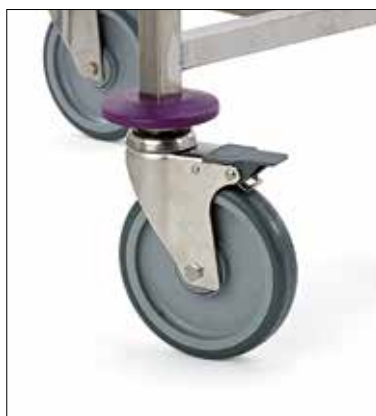
Optional castors diam.150 mm

All these trolleys are fitted with Ø 125 mm stainless steel wheels, 2 with brakes for safer use. These wheels meet the requirements of NF approval.