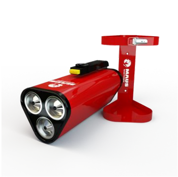
Maus Xtin 3