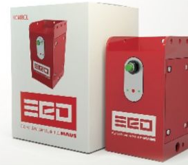
58 x 54 x 104 mm

EGO Kontrol EGO Kontrol can be used with conventional gas fire suppression systems, with linear heat detecting cables and with EGO Kegel. EGO Kontrol is a link between different types of suppression systems and heat detecting devices.