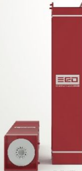
58 x 55 x 1072 mm

EGO Blast 15 is the big brother of EGO Blast 6 and together they can protect areas where space is an issue. It can by itself protect spaces up to 1,5 m 3 . Connect it to EGO Kegel or EGO Kontrol.