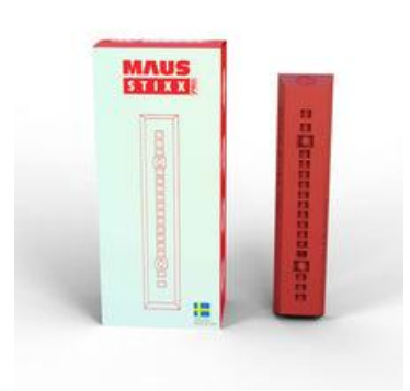
maus Stixx Pro