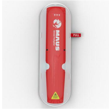
Maus Xtin wall mount