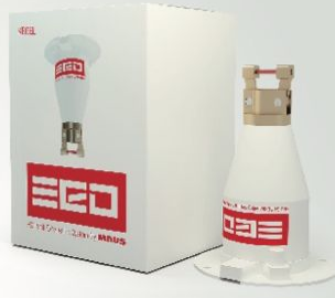
Ø65mm, H 100mm

EGO Kegel is a Thermal Activation Generator which can detect fires and activate the EGO Blast Series. It does not need electricity or batteries. It uses electromagnetic induction to generate electrical current. Depending on the thermal bubble it can detect heat in 57°C, 68°C, 79°C, 93°C, 141°C, 182°C och 260°C. It can also provide an output signal to shut down the electric system or start an alarm.