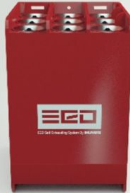
194mm (L) x 186mm (W) x 282mm (H)